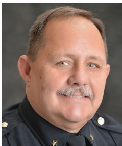
Chief of Police University of Indianapolis