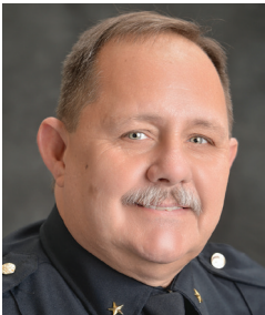
Chief of Police University of Indianapolis